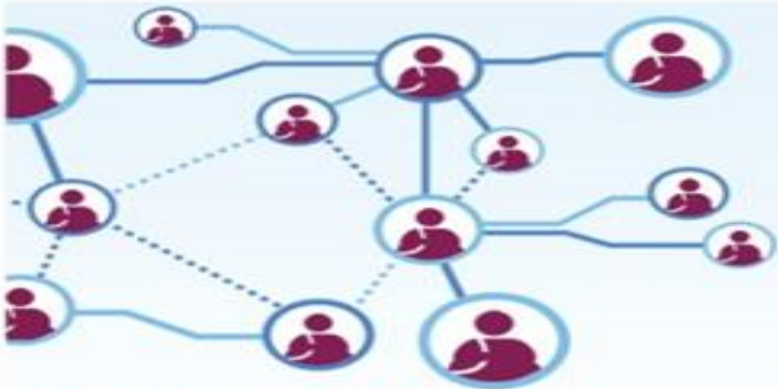
ITN Innovative Training Networks