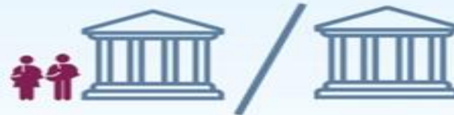
COFUND Co-Funding of Regional, National and International Programmes