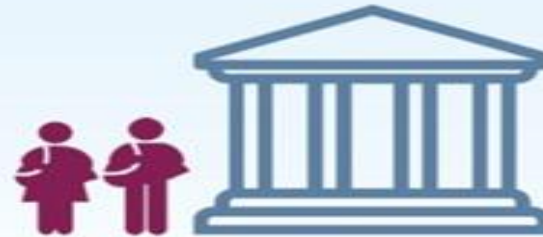
IF Individual Fellowships