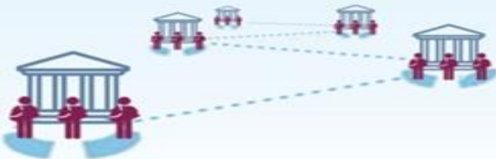
RISE Research and Innovation Staff Exchange